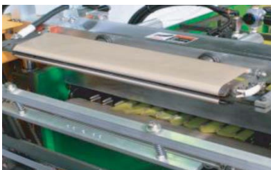
Durable Sealing & Cutting Device